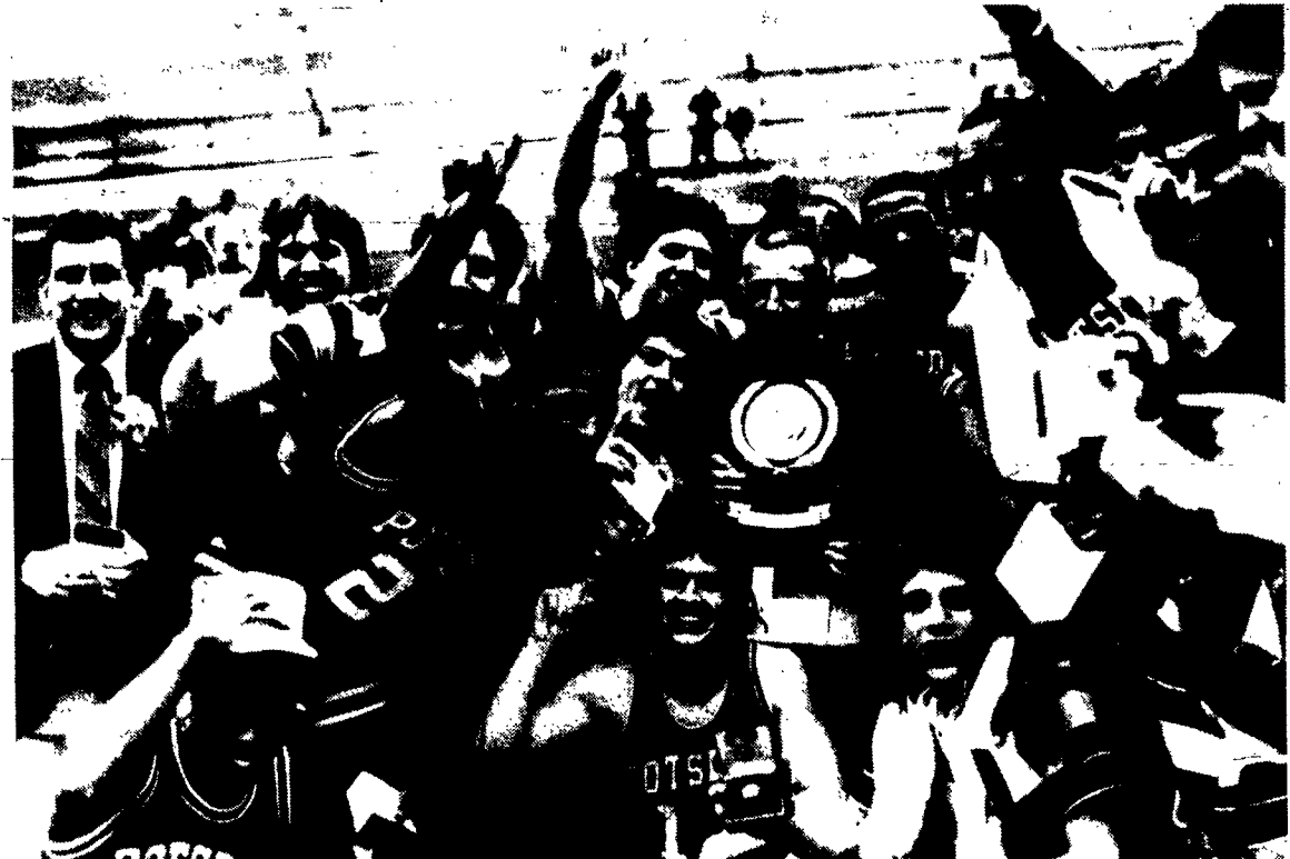
UNBEATEN CHAMPS — Number one signs were prevalent last year as the Potsdam College Bears blasted their way to an undefeated Division III national championship. Here, they are shown posing with their championship trophy in Grand Rapids, Michigan.