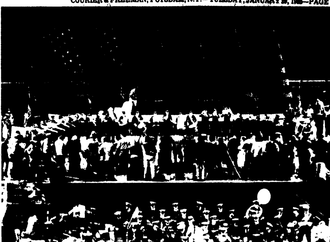
INDOOR PERFORMANCE — After the inaugural parade for President Ronald Reagan was cancelled due to bitter cold temperatures in Washington, D.C., the Norwood Brass Firemen (center of photo) performed indoors, at the Capital Center sports coliseum.