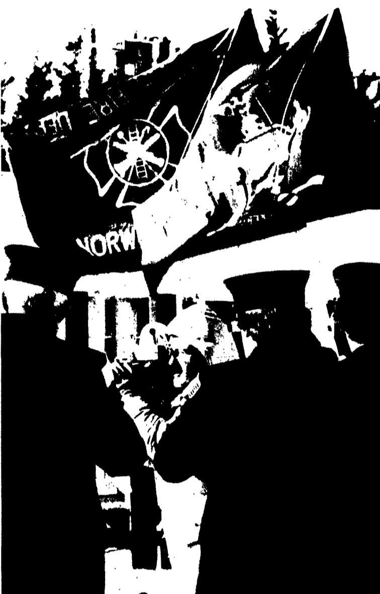
ON FILM — Despite the bitter cold, members of the Norwood Brass Firemen performed for a CBS film crew outside their Virginia motel Jan. 20.