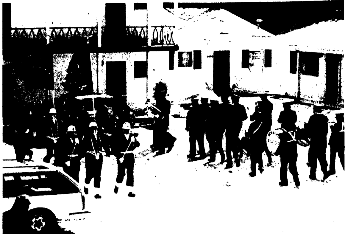
ON PARADE — While the CBS TV cameras rolled, the Norwood Brass Firemen marched in formation in front of their Alexandria, Va. motel.