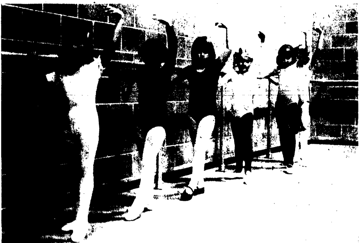
YOUNG DANCERS — "Tendu en face, mesdemoiselles..." Six of the children who enrolled in Potsdam College's non-credit course "Children's Ballet" rehearse at the barre. New classes begin the