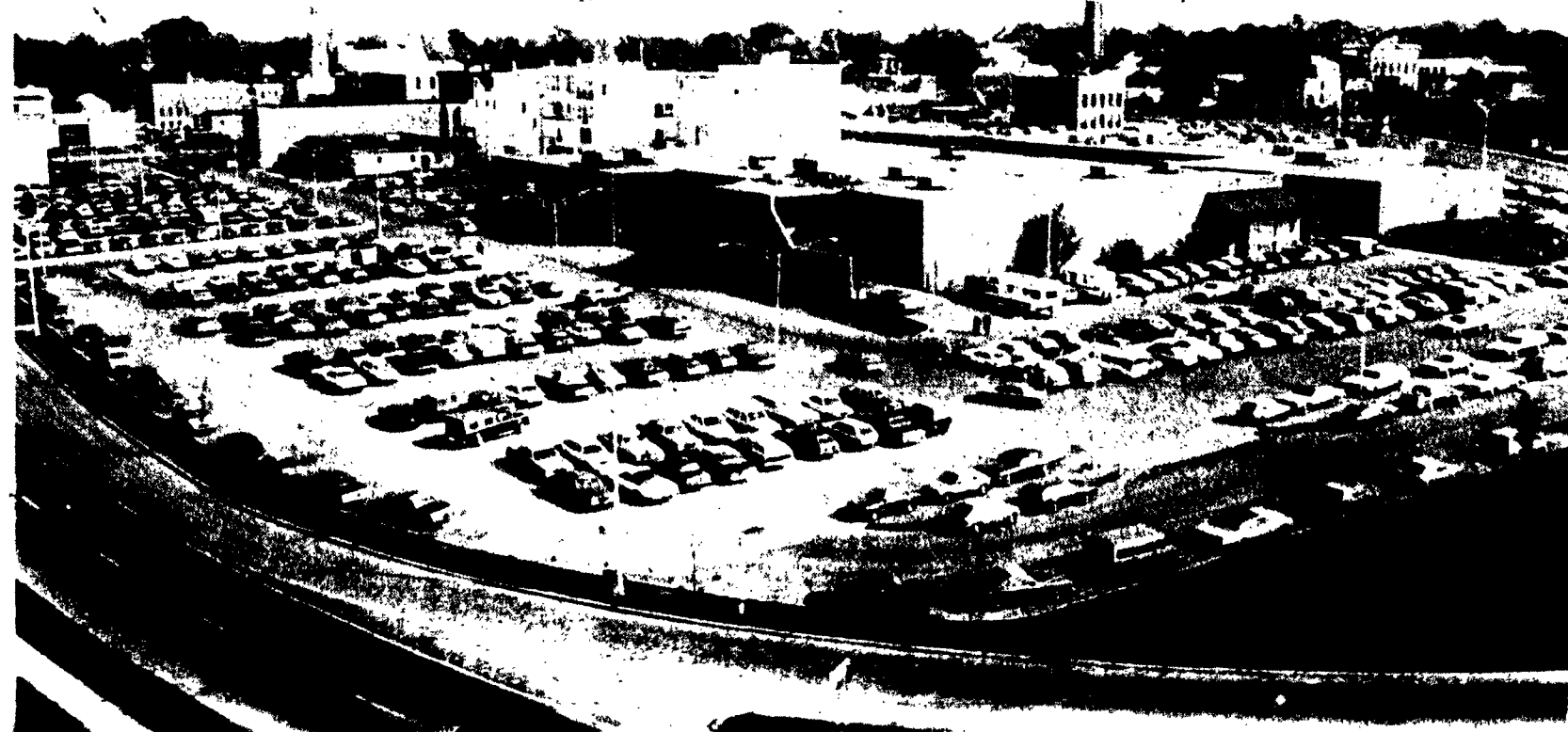
FULL HOUSE — A full parking lot at the CharlesTown mall, and led to high hopes for its success. Ogdensburg Factory Outlet Center marked the opening of the new