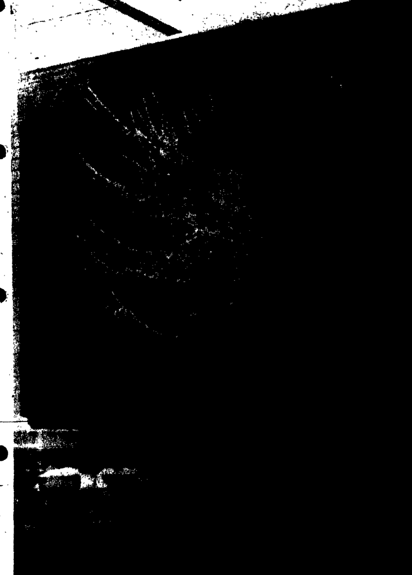
FROSTY TREE — Frigid temperatures and rising mist combined this week to produce frost-covered trees like the one shown above on Market Street.