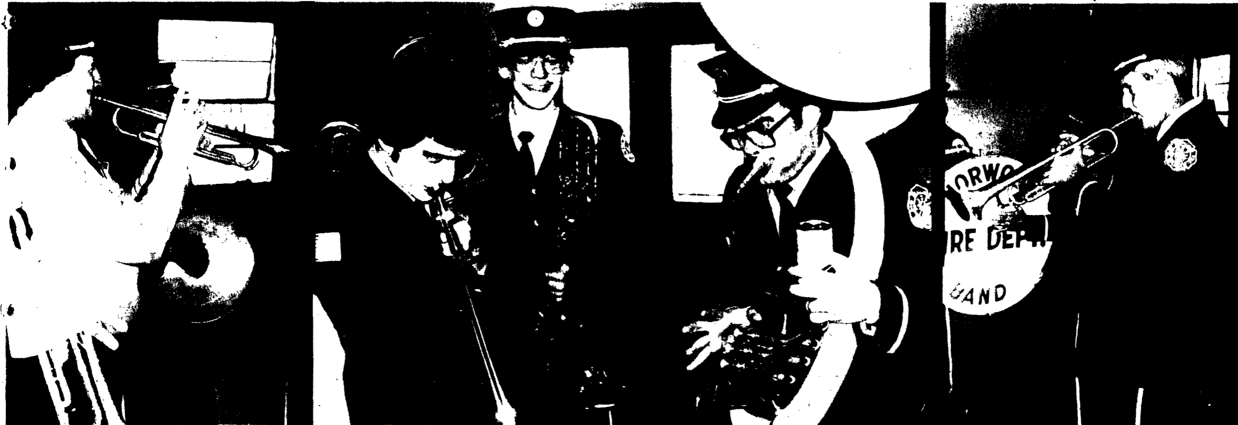
BRASS REHEARSING — The Norwood Brass Firemen held a rehearsal and photo session in the Norwood Municipal Building Monday, in preparation for their