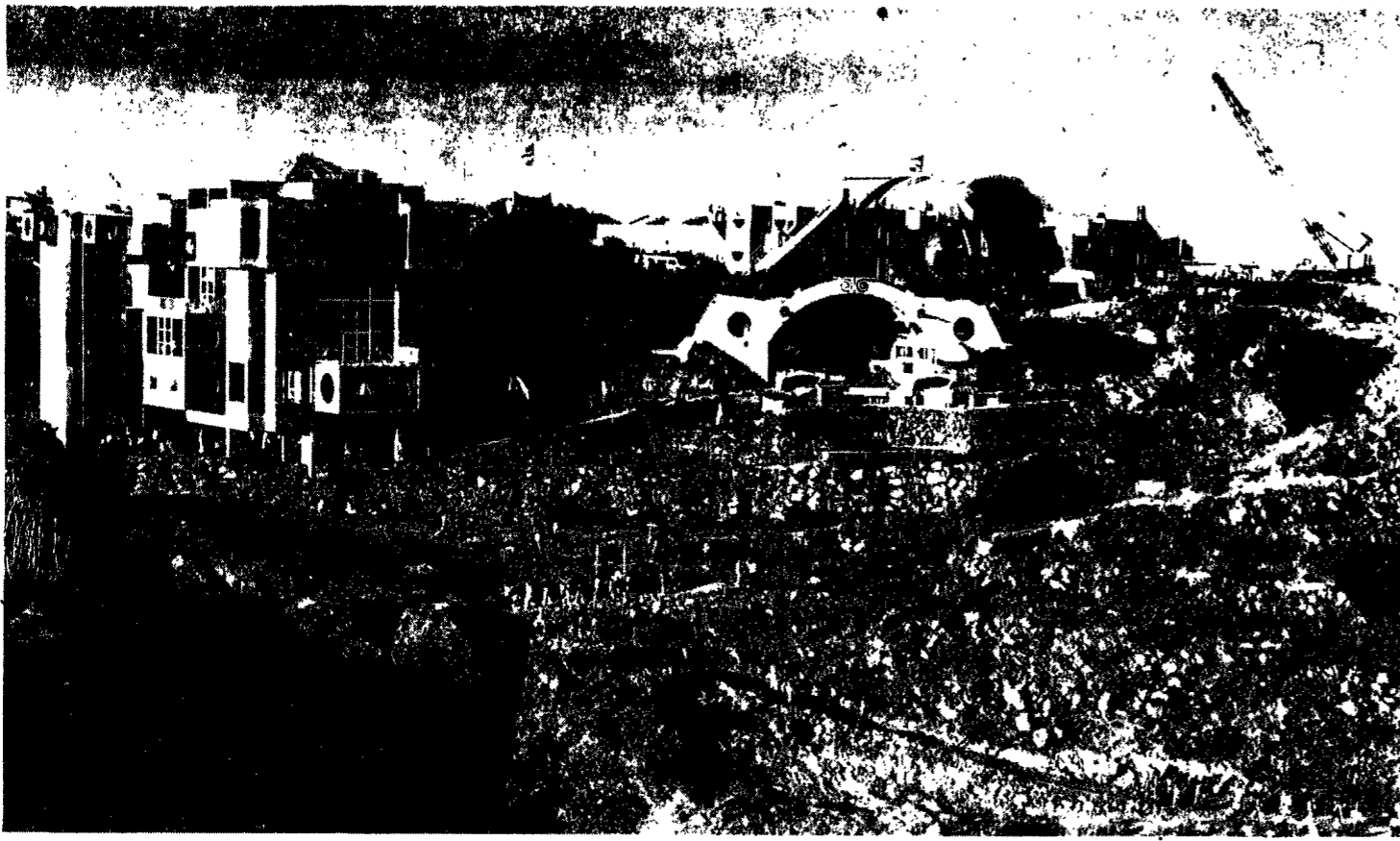
ARCOSANTI — A view of Arcosanti, the Arizona "dream city" designed by Paolo Soleri. The community is featured in a photographic exhibition touring the Associated Colleges of the St. Lawrence Valley.