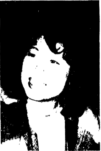
MARIMBA VIRTUOSO — Keiko Abe, Japanese marimba virtuoso, will perform in public concert at 8:15 p.m. Nov. 8 in Helen Hosmer Hall, Potsdam College campus. A reception in the Crane Green Room will follow the concert.