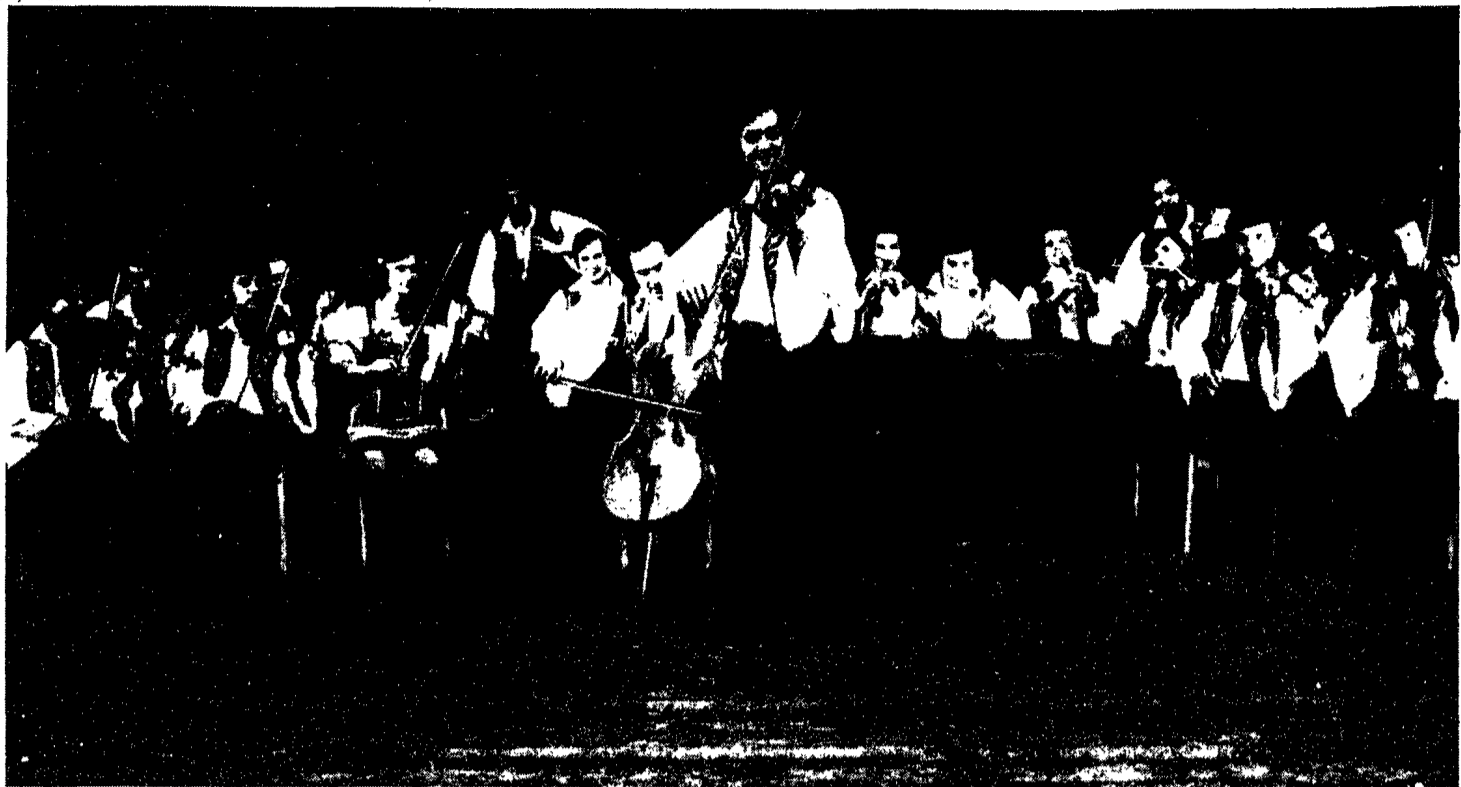
GYPSY ORCHESTRA — The Rajko Hungarian Gypsy Orchestra and Dancers, above, on their fifth tour of the Western Hemisphere, will appear in Hosmer Hall, Potsdam College campus, at 8:15 p.m. Nov. 17. Presented by the Associated Colleges of the St. Lawrence Valley as the third program in the Celebrity Artist Series, the performers have offered programs of music and