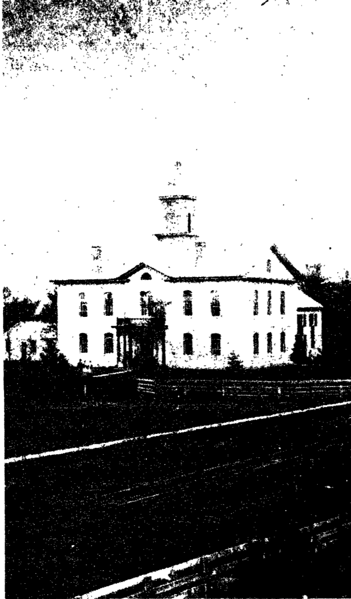
ST. LAWRENCE ACADEMY — This rare photograph of the old St. Lawrence Academy in Potsdam has been donated to the Potsdam Museum.

the citizens of Potsdam, would like to think of Potsdam as the safe, small town that it was not very long ago. The charm and grace of a small town is something that is not very easily destroyed or forgotten. However, the ever-increasing number of attacks on women walking alone at night is making Potsdam appear more and more like a city much larger in size. "You, as mayor of Potsdam, should have special concern over this matter. The fact that it is becoming dangerous for a woman to walk alone after dusk is a frightening one. Something should be done to offer more protection to us, and to offer guidance and support to those who have already become victims. "Some possibilities to minimize these attacks are better lighting on more of the streets in town, stronger police patrol of the back streets, and making sure that the women of Potsdam are well informed about this matter. Another important point is to encourage women to report these attacks so that action can be taken to find the molester or molesters. "It is a sad situation when the women of Potsdam cannot feel free to walk alone safely. Perhaps better prevention of these attacks will make Potsdam the safe, small town it once was."