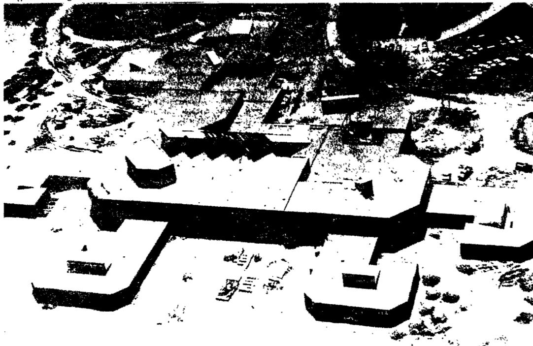
NEW BUILDING — Aerial view of the St. Lawrence Psychiatric Center's new $14,000,000 building. Construction is scheduled to be done and the facility opened by mid-summer this year.