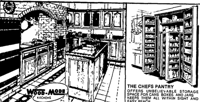
THE CHEFS PANTRY OFFERS UNBELIEVABLE STORAGE SPACE FOR CANS, BOXES AND JARS. SEESE THEM ALL WITHIN SIGHT AND EASY REACH

WOOD-MODE BATHS DAYS WOOD-MODE FURNITURE