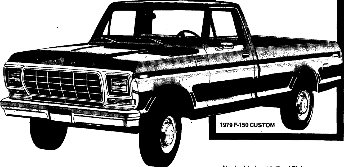
1979 F-150 CUSTOM

No doubt about it, Ford Pickups are tough to beat! That's why most folks favor Ford Pickups. Look to America's best seller for the tough performance you need, and to your Ford Dealer for the best buy in town.