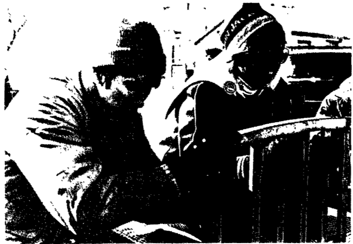
BED RACE--Contestants in the bed race get set to go.