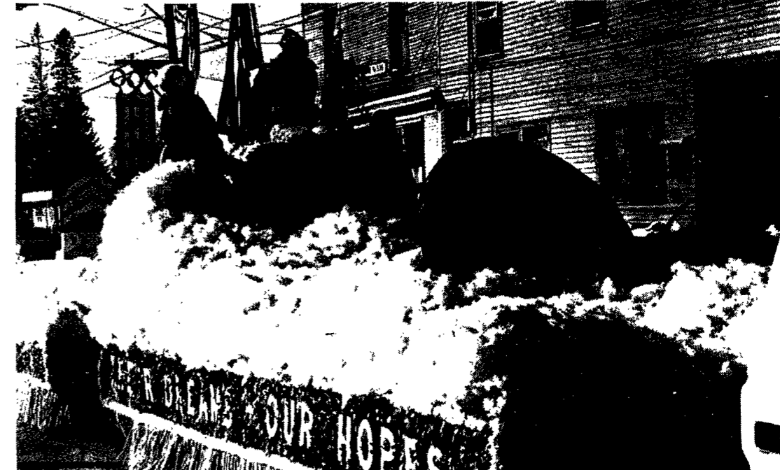
WINNING FLOAT--The St. Lawrence National Bank had the top entry for beauty in the parade.