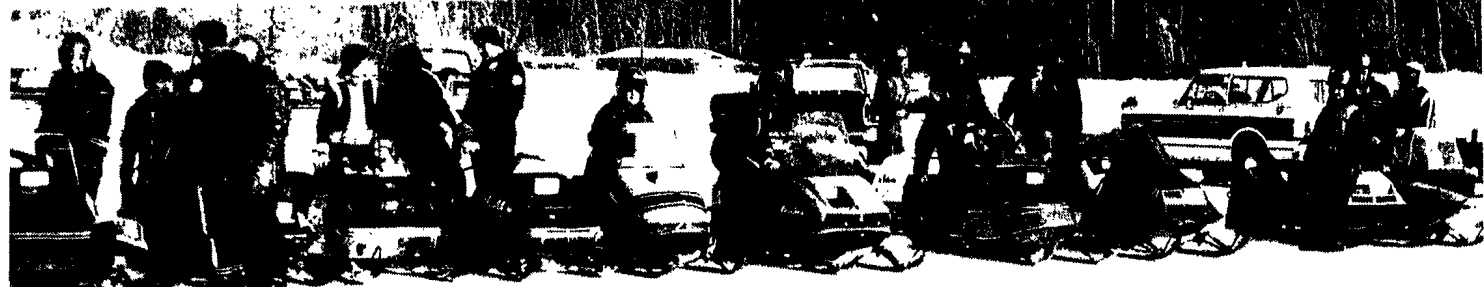
SNOWMOBILE WEEKEND —The sixth Annual snowmobilers Against Cancer weekend was held Feb. 3 and 4 at Hounds Haven in Hannawa Falls. The weekend included auction and dance on Saturday, a Poker Run, Snowmobile-a-thon, Steer