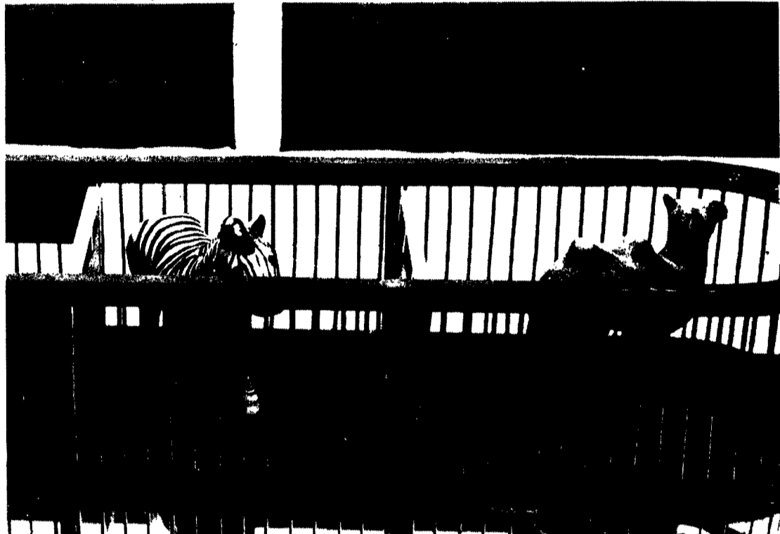
WOODEN MENAGERIE—A hand-carved zebra and camel are part of Frederick's collection.