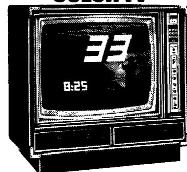
Model 4811 — Contemporary styling

TRADE IN YOUR OLD TV AND SAVE UP TO $100 ON MAGNAVOX TOUCH-TUNE COLOR TV