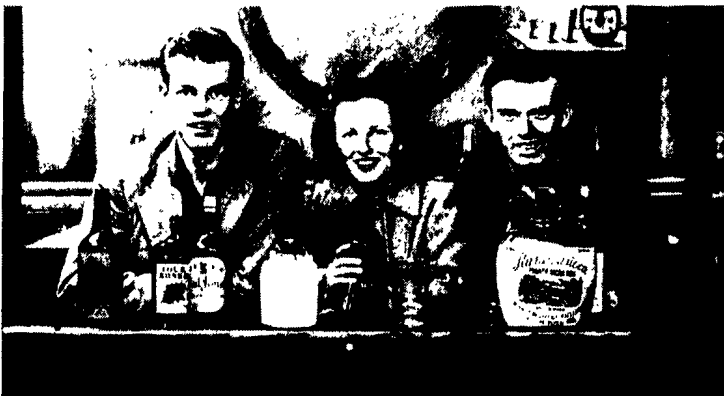
THERE ARE TIMES when dated photographs cannot be passed up. This relic containing the smiling faces of Potsdam area residents from years gone by, should bring a smile to the face of anyone who can recognize the participants.