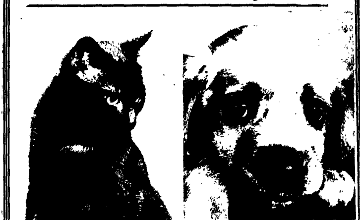
By: Judy Aaraj and Florence Helbig

A SINGLE FEMALE DOG, ALLOWED TO BREED, HAS FOUR PUPPIES- AND FOUR OTHER DOGS MUST DIE.