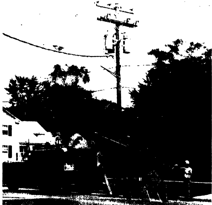
NEW YORK TELEPHONE workers have been installing new underground feeders for the northeast sector of Potsdam recently. Spokesmen for the company have noted that the new cable will beef up exhausted feeder facilities and provide a "certain amount" of spare capacity for potential growth.

The recommendation was made by the Department following successful investigations by DMV officials into many cases of odometer rollbacks.