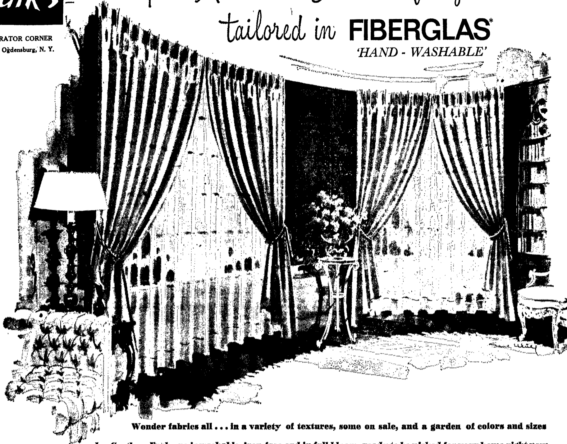
Wonder fabrics all... in a variety of textures, some on sale, and a garden of colors and sizes by Cortley. Each one is washable, iron-free and in full bloom, ready to be picked for your home right now