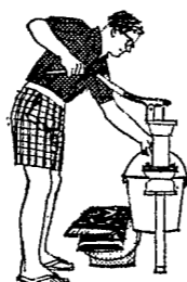
This summer Harry's renting a cottage with indoor plumbing—on what he saved at his Chevrolet dealer's

Cruise this vacation in Impala comfort with foam-cushion seats, a trunk like a small trailer and your caliber 6 or V8 whisking you along. This year's Chevrolets are the most—and right now so are the savings.