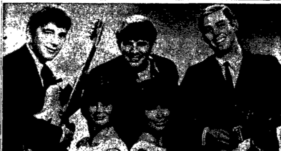
THE BITTER END SINGERS WED., AUG. 10, THURS., AUG. 11 and FRI., AUG. 12 at the GOUVERNEUR & ST. LAWRENCE COUNTY FAIR A combination of Folk, Dixieland and Rock—a New Sound in Music