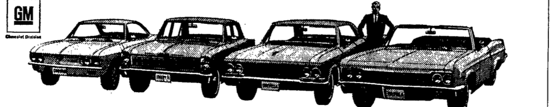
Left to right: Corvair Monza Sport Coupe, Chevy II Nova 4-Door Sedan, Chevelle Malibu Sport Coupe and Chevrolet Impala Convertible. Each comes with an outside rearview mirror and seven other standard features for your added safety. Always check your mirror before you pass.

SEE THE MAN WHO CAN SAVE YOU THE MOST YOUR CHEVROLET DEALER