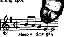
Food by the former Chef to the Duke of Windsor