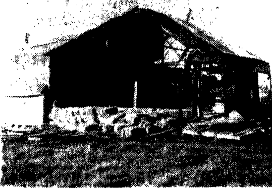
WIND DAMAGE on Sunday evening accounted for the scene above, showing a large portion of the roof of the 30 by 50 foot barn after the high winds blew it to the ground. In the foreground can be seen some of the baled hay which had been stored in the structure.

Callers at the home of Mrs. Winnie Jenner on Sunday were