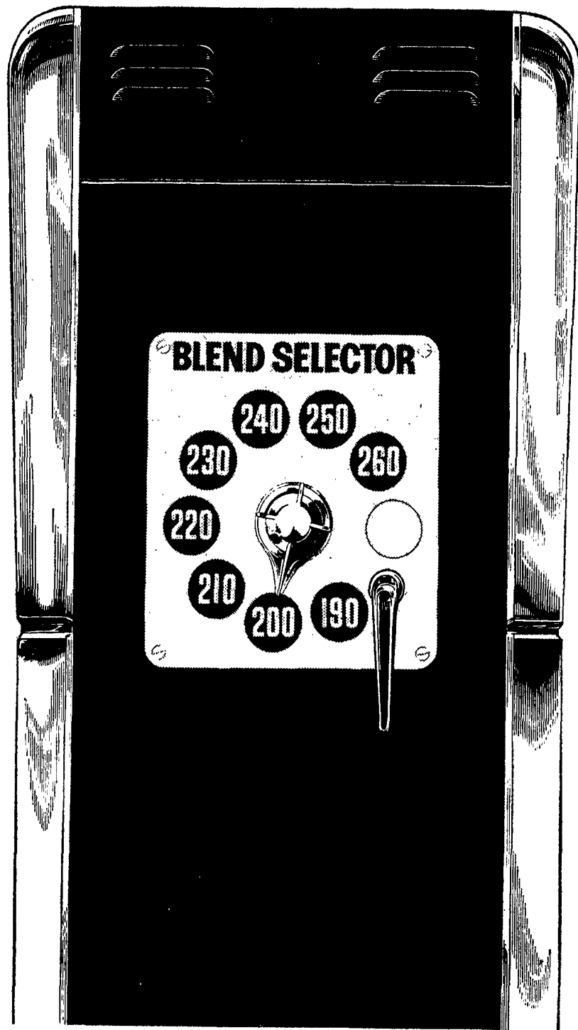
CUSTOM-BLENDING: 8 different octane-strength gasolines, 8 different prices, to give you the best gasoline for your car at the fairest price!