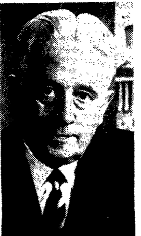
SEN. KENNETH KEATING