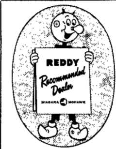
GLOPMAN'S Furniture & Appliance Norwood, N. Y.

The Order of the Eastern Star is a philanthropic organization which provides assistance for its needy members, maintains a Home for the Aged at Oriskany, and helps provide services for hospitalized veterans and for members of the armed forces both here and abroad.