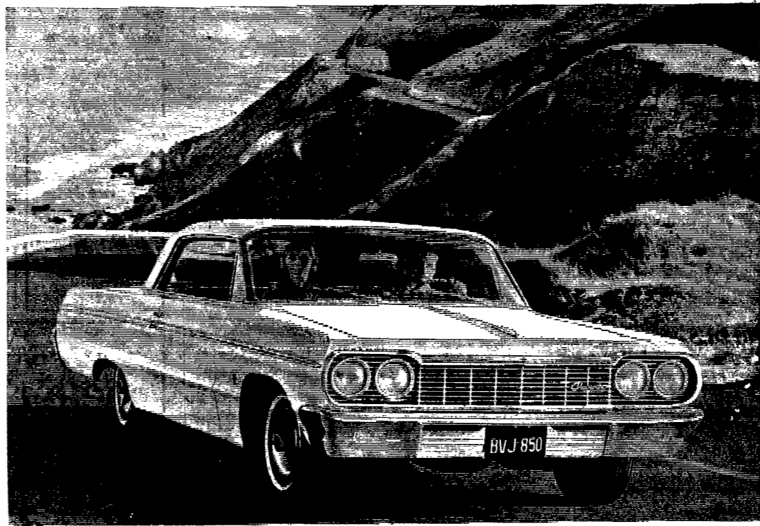
Chevrolet Impala Super Sport Coupe

It's Trade 'N' Travel Time at your Chevrolet dealer's—the perfect time to try the Jet-smooth ride. Find the meanest stretch of road you can. Then see for yourself how straight a crooked road can feel.