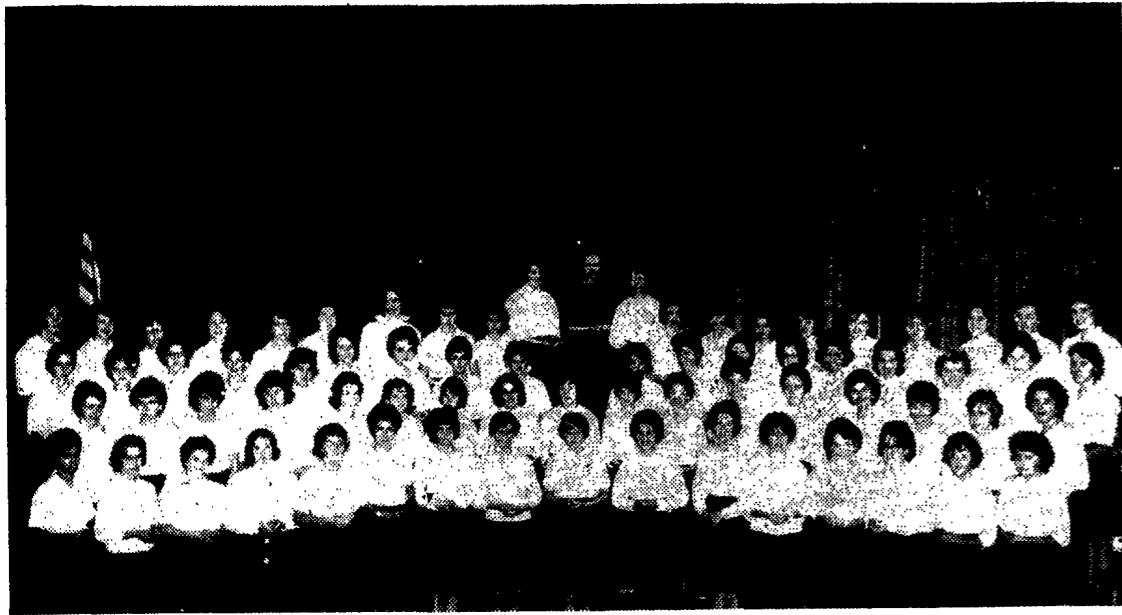
UNUSUAL PRESENTATION — The Girls Glee Club of Norwood-Norfolk Central School will perform two "Ave Maria" settings, one by Schubert and the other by Arcadelt, at the annual Junior-Senior High School Concert in the High School