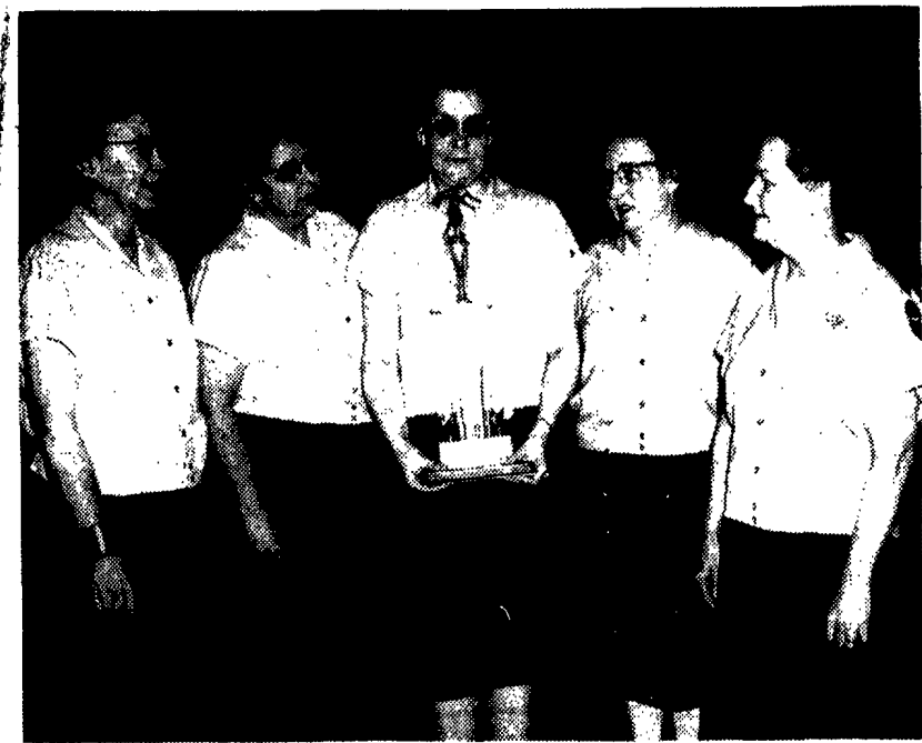
WOMEN KEGLING CHAMPS — Proudly displaying a trophy of unusual size, the Norwood Bowl Team took top honors this year in the Norwood Women's Bowling League