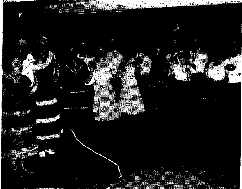
THE HOBBY OF FOLK-DANCING — These Potsdam area folks gather on Saturday nights in the lounge of the Civic Center to participate in a tradition unique in our area, folk-dancing. Seen here are members of the Potsdam Polka-Dots, who have entertained hundreds throughout the State and the East with their colorful and authentic dances. Some of these dancers will participate in St. Lawrence County Honor Day at the New York World's