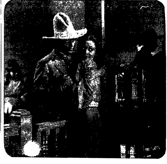
"If he shoots again, you jump in front of me while I scoot out the back door and get my gun!"