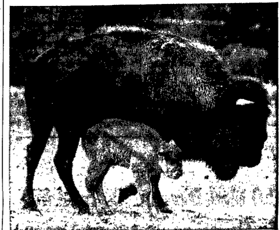
Little fellows like this are bringing the buffalo back.