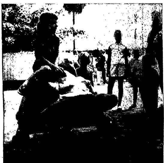
Little girl has fun riding Knobby, a Galapagos tortoise.

Boys and girls visiting Children's Zoo at San Diego Zoo, San Diego, Calif., can expect anything in the way of excitement. Tots and older children come nose to nose with baby llamas, lions, alpacas, ostriches and other animals. You can even ride a huge Galapagos tortoise. One named Knobby, never grows tired of carrying children on the back of his horny shell. The Children's Zoo features open moated enclosures. Boys and girls can lean comfortably on the moat walls. They can be served at a lunch counter just their height. They also can treat their friends to a special party. The zoo for a charge supplies the refreshments and services. A scheme of one-way traffic is arranged at the zoo. One starts at the ticket window. Its counter is only 25 inches high. The first exhibits inside the entrance include the macaws, squirrel monkeys, walk-through bird cages and the 400-gallon Turtleorium. One