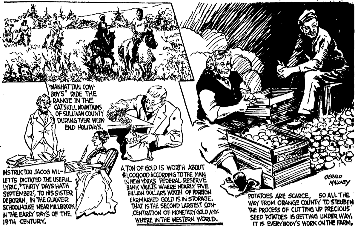
MANHATTAN COWBOYS RIDE THE RANGE IN THE CATSKILL MOUNTAINS OF SULLIVAN COUNTY DURING THEIR WEEK END HOLIDAYS.