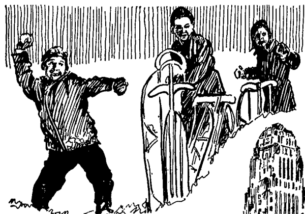
AS ELSEWHERE IN THE STATE, A SNOW-FALL IN NEW YORK CITY IS THE PRELUDE TO A SNOWBALL BATTLE FOR YOUNGSTERS IN CENTRAL PARK.