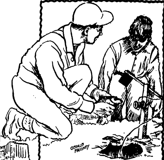
TIP-UP ICE FISHING IN THE STATE ATTRACTS AN INCREASING NUMBER OF DEVOTEES OF BOTH SEXES. THOSE SEEKING SHELTER AS THEY FISH MAY SECURE PORTABLE HEATED HUTS ON THE ICE OF OTSEGO LAKE, ONE OF OUR BETTER WINTER FISHING RESORTS.