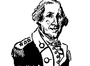
PORTRAIT OF GEORGE WASHINGTON BY CHARLES W. PEALE DISPLAYED IN PHILIPSE-MANOR, YONKERS, IS LESS FAMILIAR THAN THE STUART PORTRAITS.