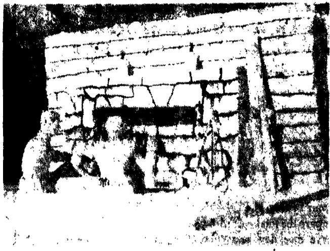
The icy fireside scene constructed by Kappa Fraternity won the CCT-PSTC Ice Carnival statue contest.