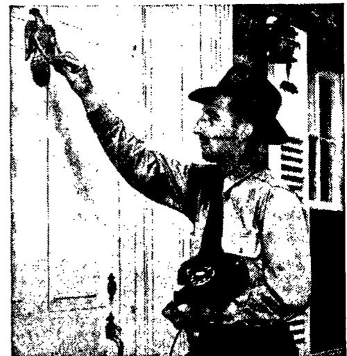
③ WAITING LISTS SHORTENED. The demand for telephones never slackened, and construction went on at a record pace. Steadily the number of people waiting for service was whittled down. People must still wait for service in some places, but we are working hard to get to them in the shortest possible time. We're using every bit of materials and equipment we can get for the purpose.