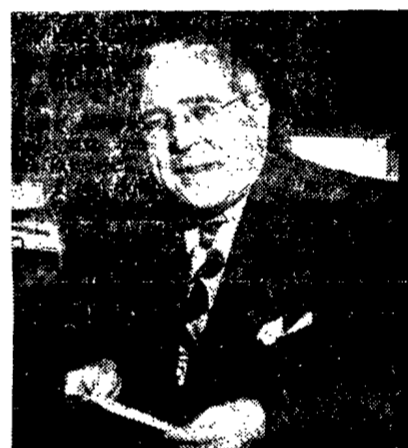
MAYOR DAVID L. LAWRENCE speaks for all Pittsburgh: "The newspaperless city is deeply hurt by people's inability to get the news accurately and fully. Their effectiveness as citizens is restricted. Our loss is seriously real. No news is really the worst news we can have."