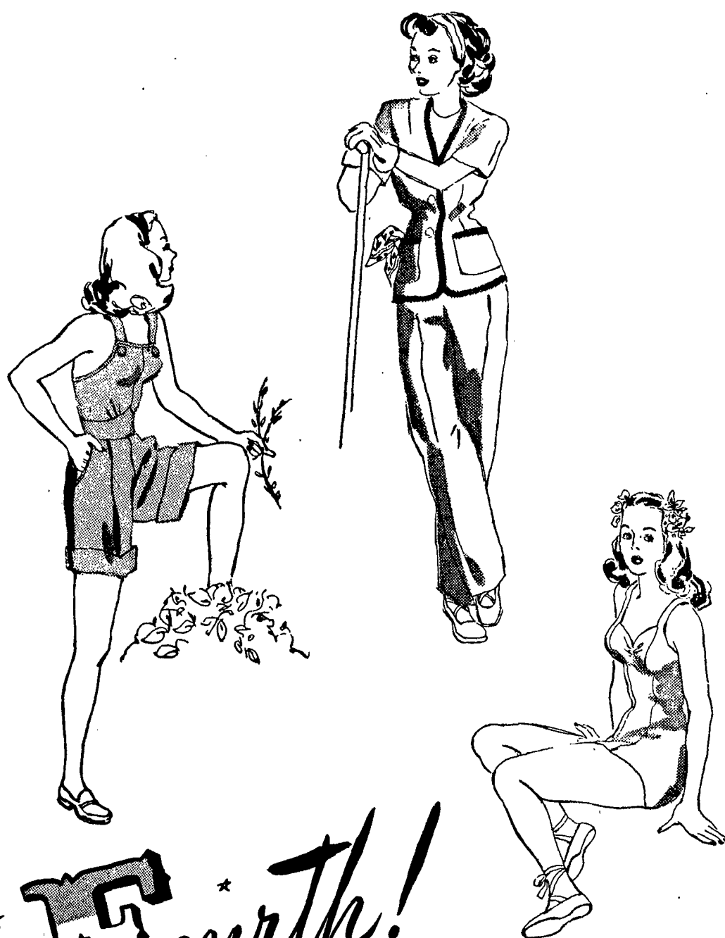
Figure sleek swim suits in white. Others. 10.95

Non-crushable butcher linen cardigan jacket and slacks. 12-20. 8.95 each