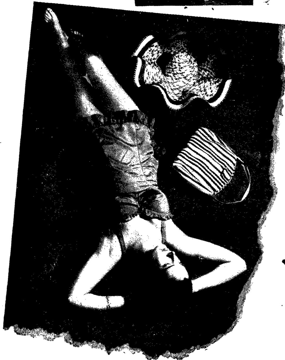
Blue faile bathing suit trimmed with ruffles. 8.95