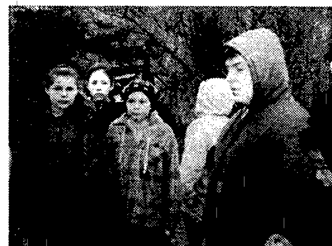
Gloomy day, gloomy faces: no trip up the mountain today