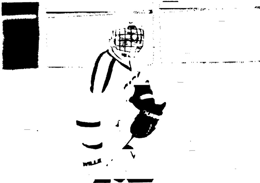
Pictured: Cody Thompson participates in the Chicago Showcase