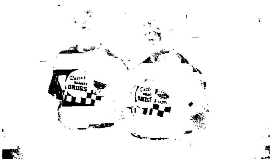
Pictured: (l to r) Constable Pat McAfee, RCMP, Cornwall Detachment and Constable Leo Philippe, RCMP, Cornwall Detachment. Both officers participated in the Racing Against Drugs Event on Cornwall Island. Not only did the RCMP participate but they set up display tables with information on addictions. One table had a closed-display of various drugs and the different forms they come in. Part of the closed-display identified various instruments used to administer different types of drugs. Students were instructed on the various items they might come into contact with which they should never touch or handle. Thanks to the RCMP for providing drug education to our children.