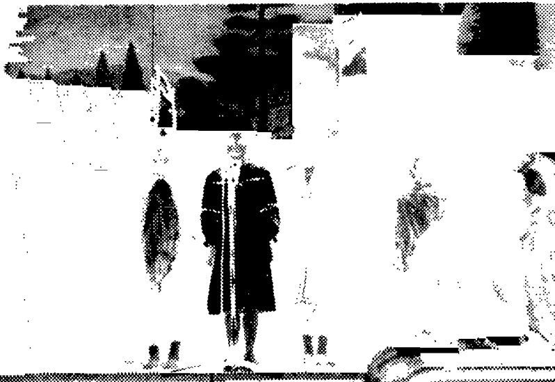
Rotiwennakehte students and staff reciting the Ohen:ton Karihwate:kwen. The students made their costumes for the play...Ohkwa:ri Iotewirarakwen.