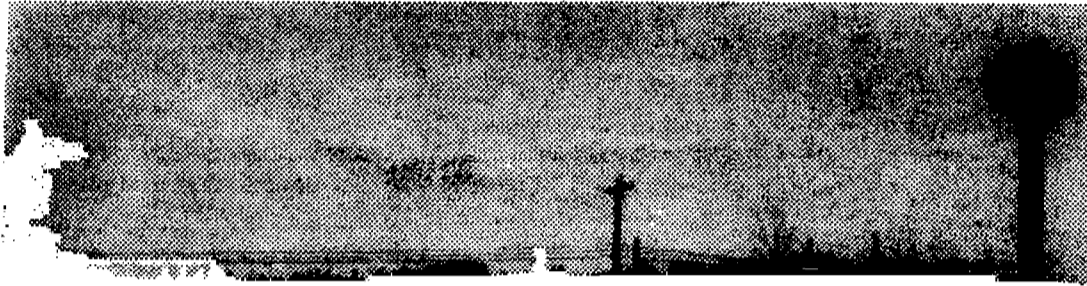
General Motors, Powertrain Division, Massena, NY. Location of hazardous waste remediation activities.