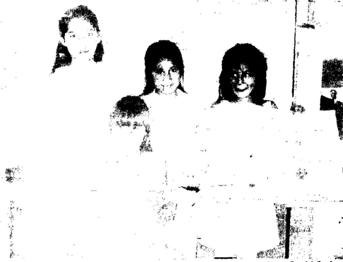
The Shenedoah Kids from the Akwesasne Freedom School.