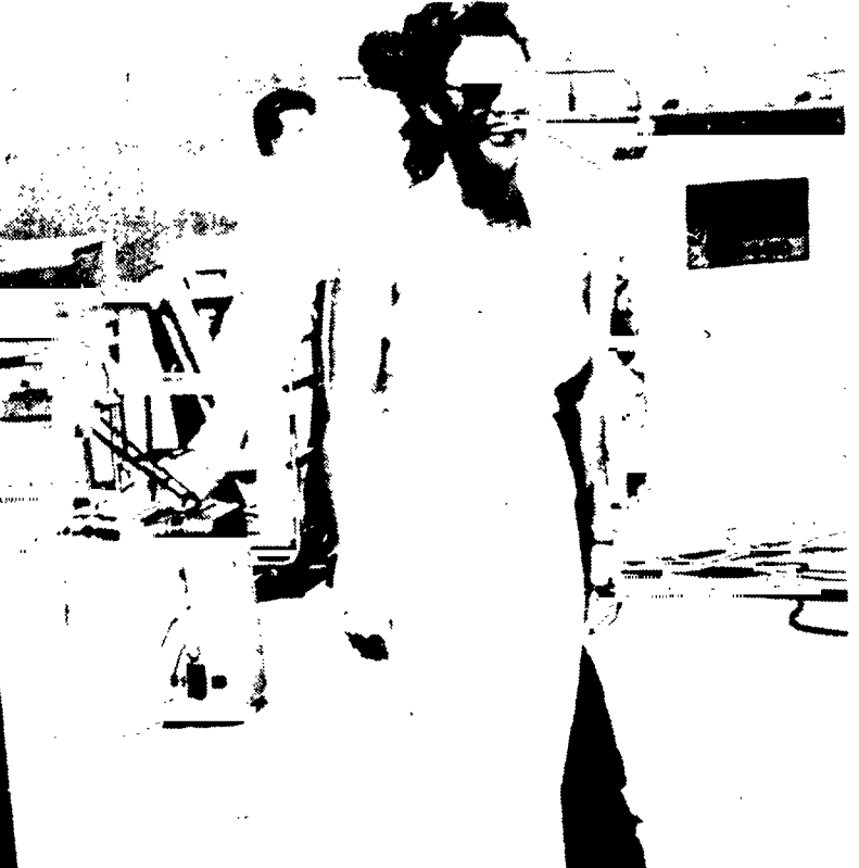
Sensational Queen Sherri.