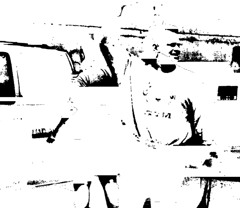
Nasty Boys Jerry Saggs (waving) and Brian Knobbs.