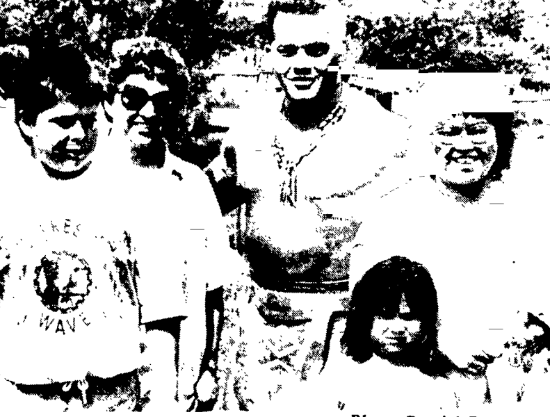
Tatanka with some new friends at the N.A.I.T.C.