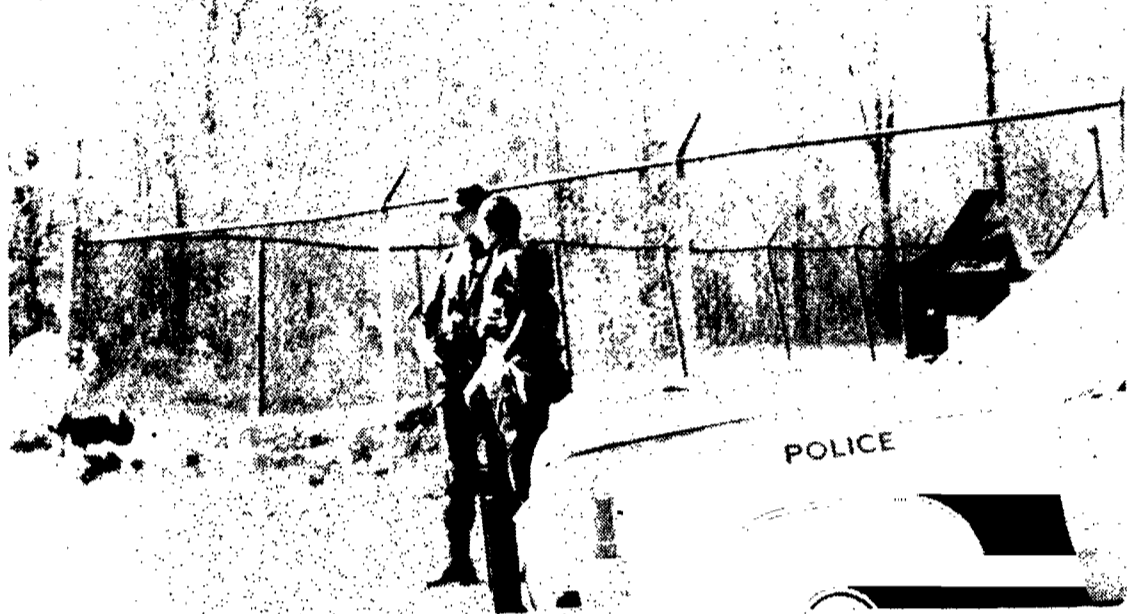
Anti-terrorist police officers observe roadblocks on Cornwall Island.