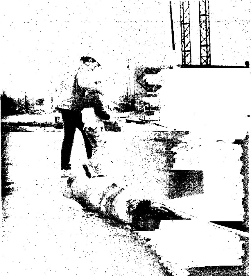
Pals. An Iroquois man and his young friend walk along the western barricade, lending each other support in a difficult time.