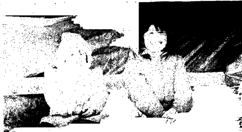
Sisters weather the rain while watching traffic at the western barricade.