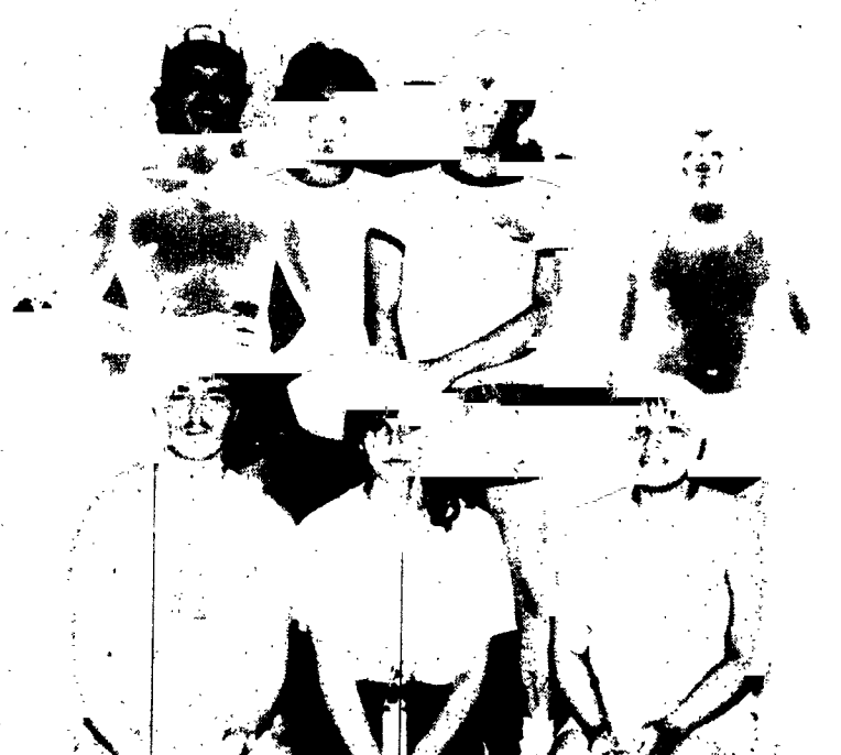
First place winners in B-Division in this past weekend volleyball tournament.