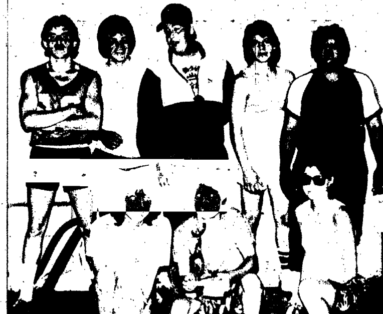
1st Place A-Division winners in this past weekend volleyball tournament.