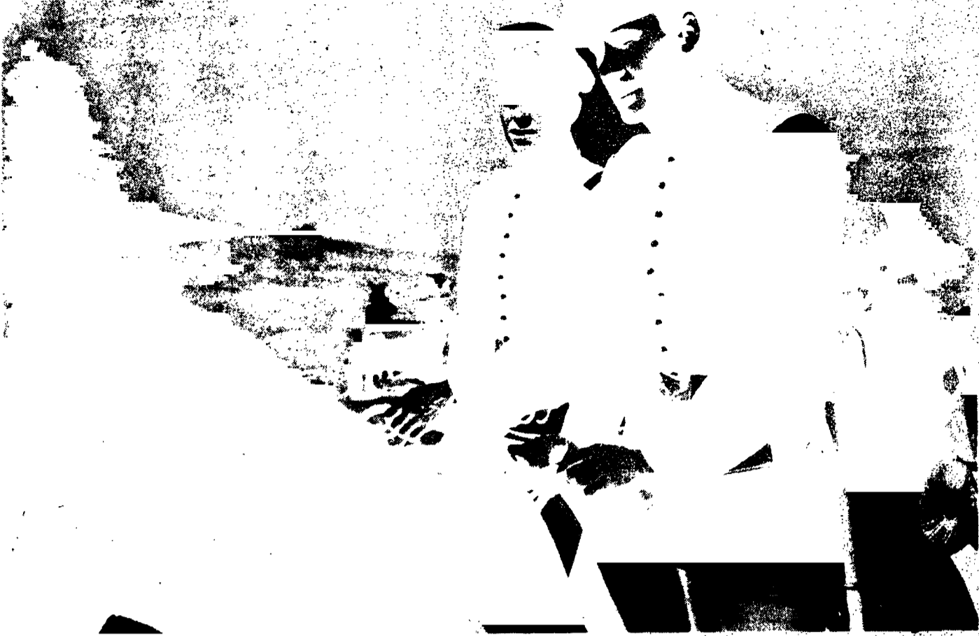
WOULDN'T YOU KNOW IT? President Ronald Reagan (above left) portraying a young George Armstrong Custer in the 1940 Warner Brothers film "Santa Fe Trail." Cavalry officer on the right is portrayed by Errol Flynn.