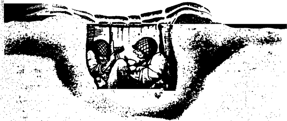
'It's bizarre. We all learn Spanish and then they ship us to Lebanon.'